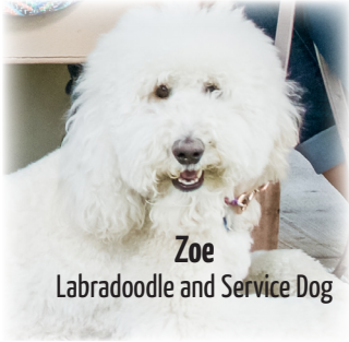
Zoe Labradoodle and Service Dog